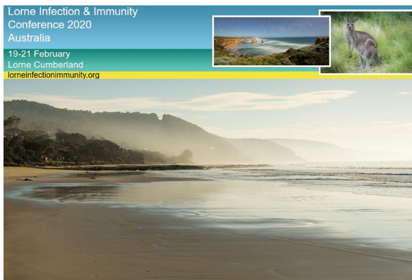
Figure 1. The beautiful beach at Lorne where the conference is held each year.

research chemist at the University of Queensland, gave an elegant short presentation on using fluorescent antibiotics in diagnosis and studies of resistance, toxicity and mechanism of action. His team has been developing fluorescent antibiotics via synthetic conjugation of small fluorescent moieties such as NBD (Cy5, 7-nitrobenz-2-oxa-1,3-dinazol-4-yl) or dimethylaminocoumarin-4-acetate to the antibiotic core in a site that does not interfere with antibiotic function, such as vancomycin-NBD. 6 Collaborators interested in applying these fluorescent antibiotics to the clinic are encouraged to contact Mark ( https://imb.uq.edu.au/profile/929/mark-blaskovich ).