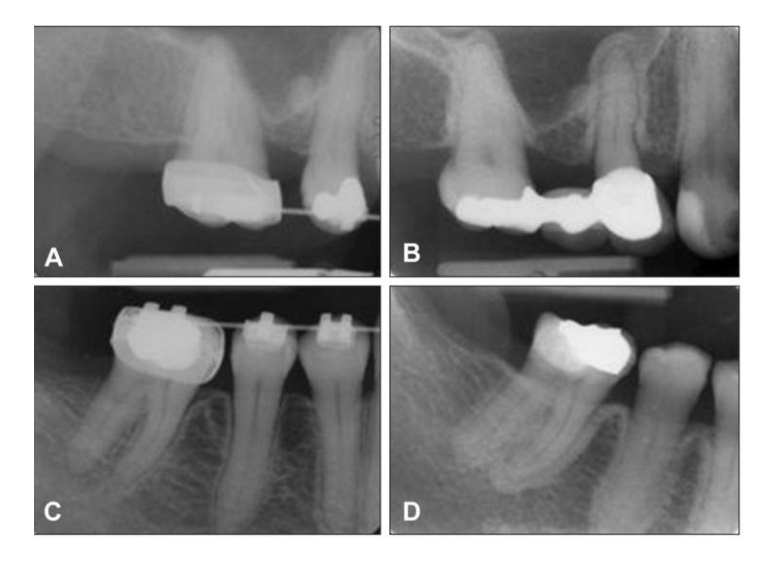
Figure 1. Periapical radiographs of a woman, showing generalized osseous sclerosis of uniform thickness involving the cortical plate and lamina dura. A and C radiographs shows the pre-bisphosphonate therapy condition of the cortical plates and the lamina dura. B and D radiographs shows thickening of the cortical plate and lamina dura after 2 years bisphosphonate therapy. No clinical signs and symptoms were established at this initial stage.