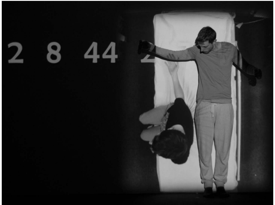
Figure 1 Bloodlines performance photo by Anna Tanczos.

by the team after the performance had been devised to explore its impact on audiences. The research uses a mixed method design comprising two elements: a short questionnaire distributed to and completed by audience members immediately after the performance, and a series of in-depth semistructured interviews with select audience members that took place at least a week after the performance.