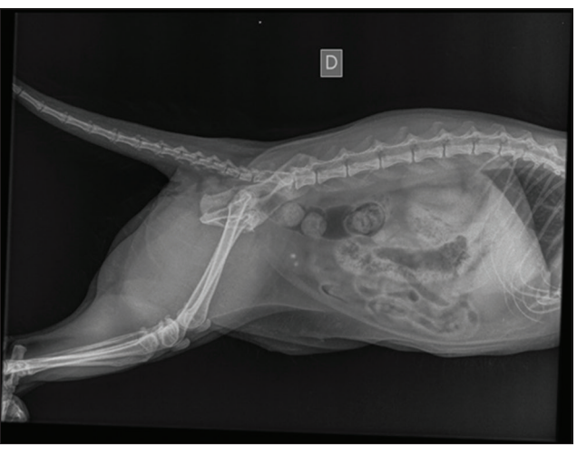
Figure-4: Standard radiographic image (lateral decumbency) in a cat showing two bladder stones.