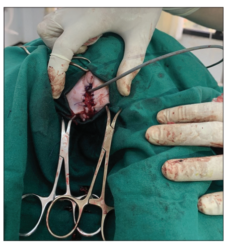
Figure-7: Obstruction in a cat perineal urethrostomy.

on the other hand (Table-2). In addition, 23 castrated cats (71.87%) and nine un-castrated cats (28.12%) were affected (Table-2). Indoor lifestyle was reported in 26 cats with urolithiasis (81.25%), whereas only six (18.75%) cats having access to outdoors were afflicted by the disease (Table-2). In the studied population, 21 animals (65.83%) consumed commercial pet food, and 11 cats (34.38%) had a homemade diet (Table-2).