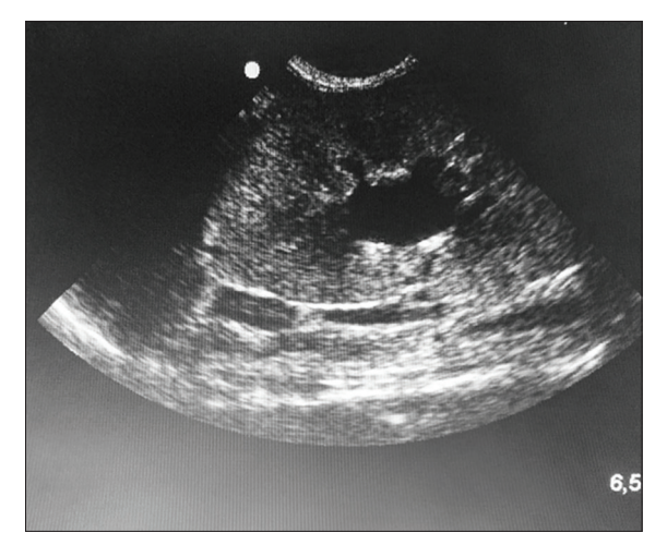
Figure-2: Ultrasonographic view of hydronephrosis in a cat.