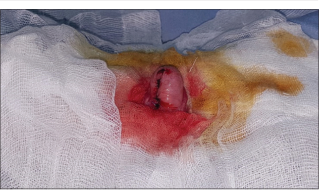
Figure-8: Cystotomy in a cat presenting bladder stones.

on the other hand (Table-2). In addition, 23 castrated cats (71.87%) and nine un-castrated cats (28.12%) were affected (Table-2). Indoor lifestyle was reported in 26 cats with urolithiasis (81.25%), whereas only six (18.75%) cats having access to outdoors were afflicted by the disease (Table-2). In the studied population, 21 animals (65.83%) consumed commercial pet food, and 11 cats (34.38%) had a homemade diet (Table-2).