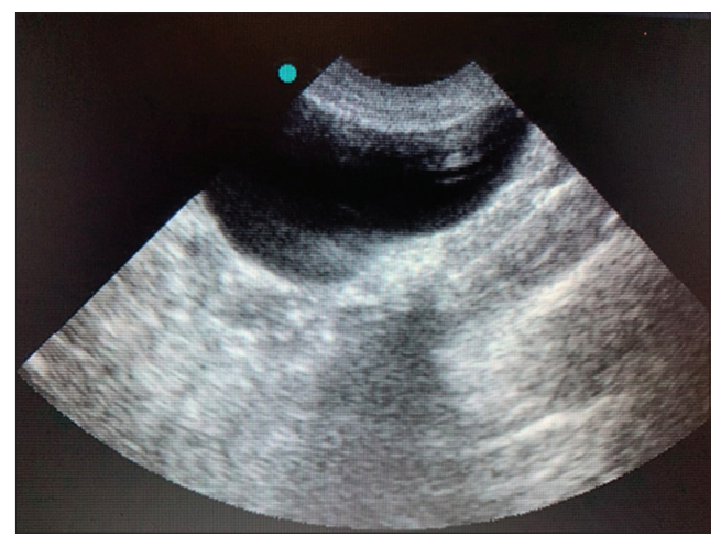
Figure-3: Ultrasonographic image of the bladder showing urinary sand.

Thus, this study showed a high percentage of male cats with urolithiasis (28; 87.50%); among them, 17 cats (53.12%) have developed an obstructive syndrome. Four females (12.50%) were concerned by urolithiasis,