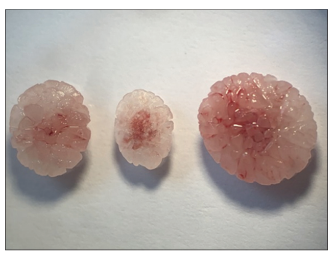
Figure-6: Struvite uroliths removed after cystotomy.