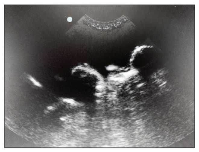
Figure-1: Ultrasonographic view of vesical uroliths showing shadow cones.

The 32 cases were eligible for both ultrasonogram and X-ray radiography. The ultrasonography was used to diagnose 14 cases of urolithiasis (43.75%); 12 uroliths were localized in the bladder, and two were in the urethra. Ultrasonographic images of uroliths were identified by a limited hyperechogenicity, accompanied by a shadow cone (Figure-1). Hydronephrosis was diagnosed in three cases (9.37%); the ultrasound imaging determined a widening of the renal pelvis, the renal diverticulum, and the ureter (Figure-2). Ultrasonography allowed the visualization of the distended urinary bladder with cystitis (12 cats; 37.5%) and the urinary bladder sand (one case; 3.13%)