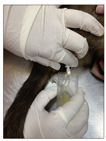
Figure-5: Catheterization in feline urethral obstruction.