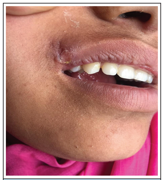
Figure 3. Follow-up in one month with spontaneous healing of plaque over upper lip.