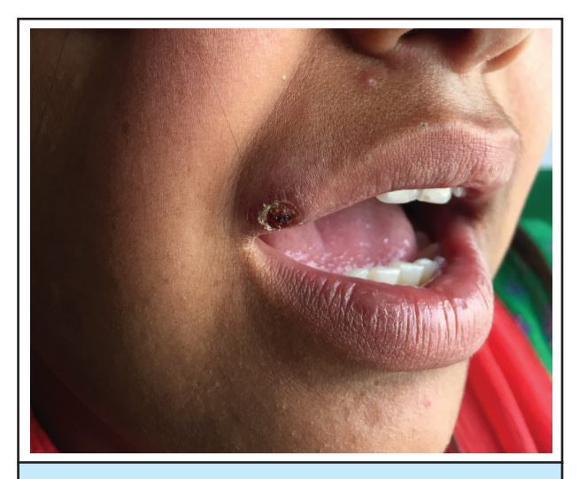
Figure 1. An ill-defined crusted plaque over upper lip.

upper lip. Neither an induration nor easy bleeding was noted. No regional lymphadenopathy was present (Figure 1).