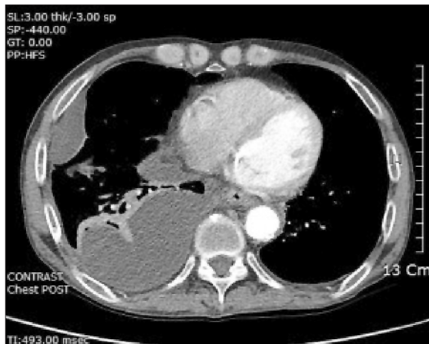
Fig. 1. Chest CT scan. Axial section shows a large amount of unilateral loculated effusion in the right lung.