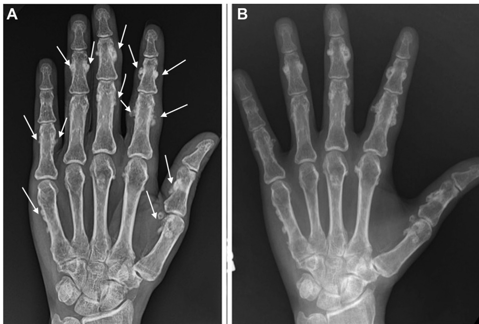
Fig. 2. A, The posterior radiograph of the left hand is notable for multifocal periosteal reaction involving the metacarpals and proximal and middle phalangeal shafts (arrows). The right hand (not shown) had similar radiographic appearances. B, Radiographic changes progressed over time.