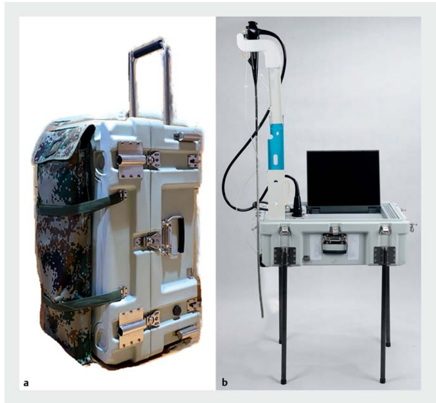
► Fig. 1 The portable endoscopy system. a In transportation status. b In working status, covered by a disposable sheathed system.

Only one portable GI endoscopy system currently exists (E.G. Scan; IntroMedic Co., Ltd., Seoul, Korea), but this is diagnostic only without any treatment function [4]. Our system has both diagnostic and treatment capabilities. Besides the portability of this system, another ad-