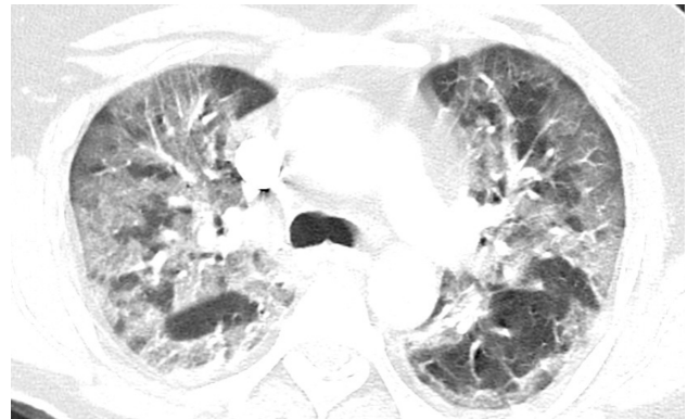
Figure 1 CT: Highly suggestive of severe bilateral SARS-CoV-2 lung infection.

Prolonged mechanical ventilation, the need for a tracheostomy, and multiple weaning attempts determined the evo-