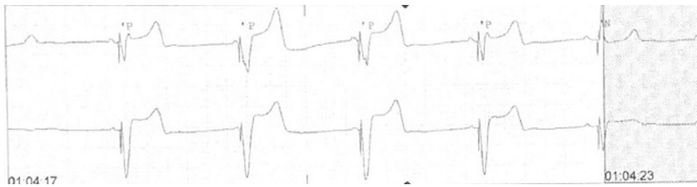
Figure 3 Pacemaker dependency after weaning isoproterenol and dopamine.

metabolized by the cytochrome P450 enzyme CYP3A4 and undergoes first-pass metabolism; therefore, it is prone to multiple drug–drug interactions. 1 Ivabradine has an active metabolite, which is an N-demethylated derivative. The effective half-life of ivabradine is approximately 6 hours. Four percent is excreted unchanged in urine and excretion of metabolites occurs via feces and urine. 10–12