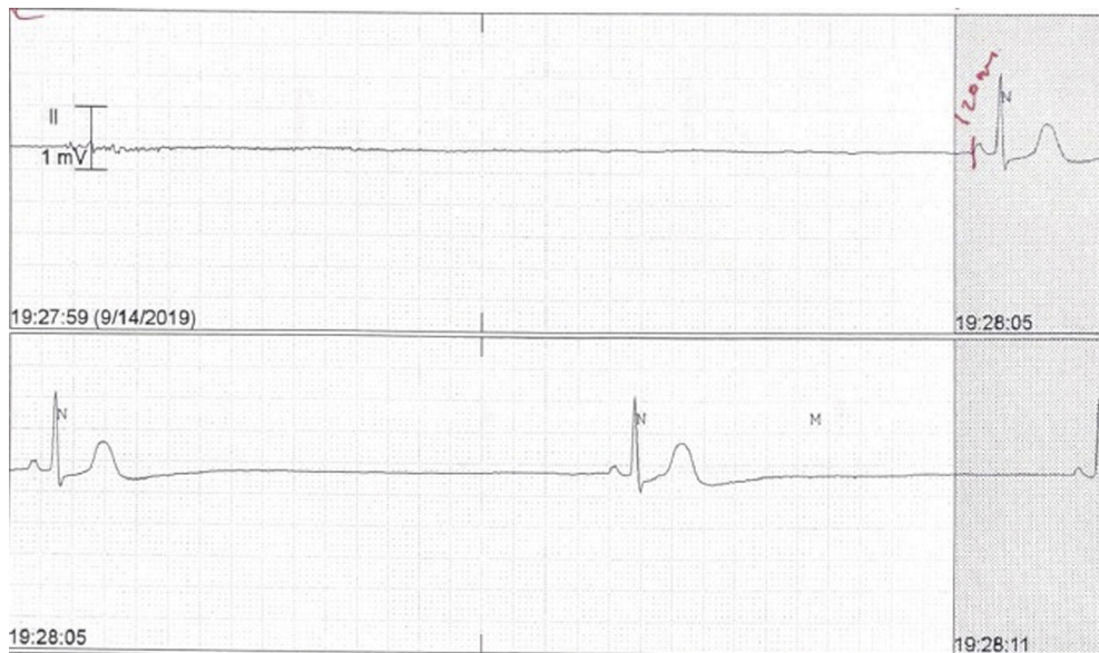
Figure 1 Severe sinus bradycardia and asystole showing no atropine.

positioned in the right ventricle apical septum, and the pacemaker was set to VVI 60 bpm, with a capture threshold of 0.4 mA at 0.5 ms. Post threshold testing, she was noted to be entirely dependent on the device (Figure 3 shows pacemaker dependency), and she had no underlying escape rhythm or spontaneous electrical activity. Dopamine and isoproterenol were discontinued after the pacemaker was secured. Her tremors resolved with washout of isoproterenol. The next day, the pacemaker setting was changed to VVI 50 bpm to allow for the patient's sinus rate to manifest. Thirty-six hours post-overdose, the temporary pacemaker was removed, and she had native sinus rhythm with a heart rate of 65 bpm consistently.