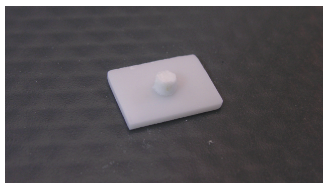
Fig. 1. A test sample with 3 mm thick veneer layer before shear bond strength testing.