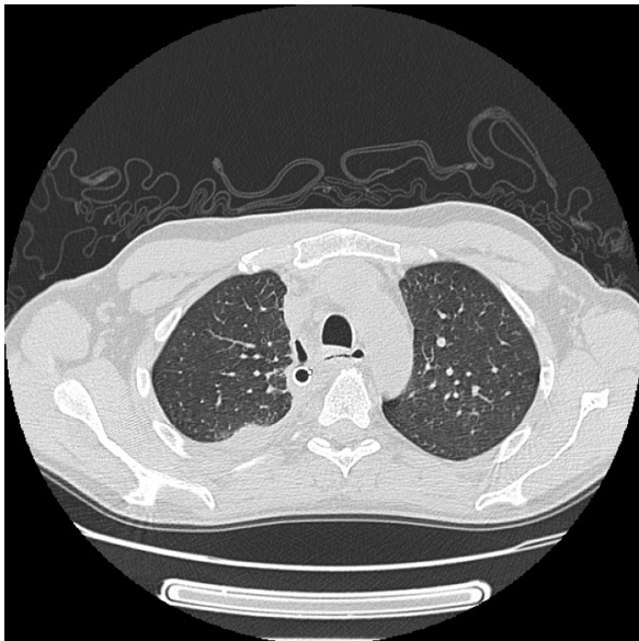
Figure 2 CT scan demonstrated the resolution of infections. It is well evident the chest drain within mediastinum on the right side that allowed the drainage of infection.

The most dreaded and probably lethal form of mediastinitis is the diffuse necrotizing variety that occurs as a