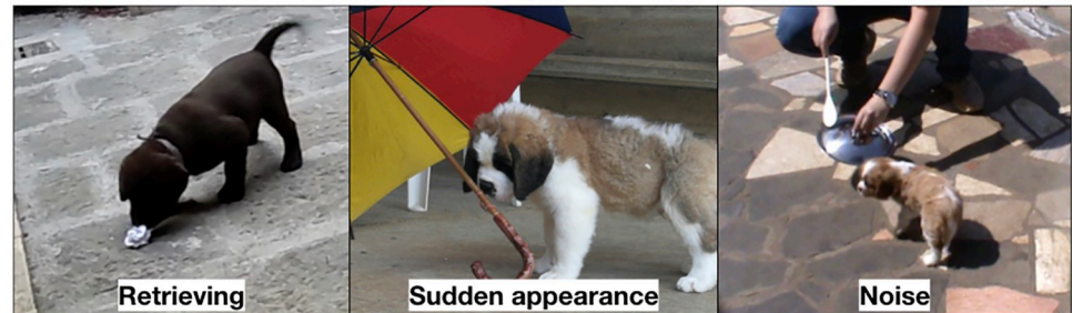
Fig 2. Retrieving, sudden appearance and noise subtests performed respectively by a Labrador, a Saint Bernard and a Cavalier King Charles Spaniel puppy.

https://doi.org/10.1371/journal.pone.0236271.g002