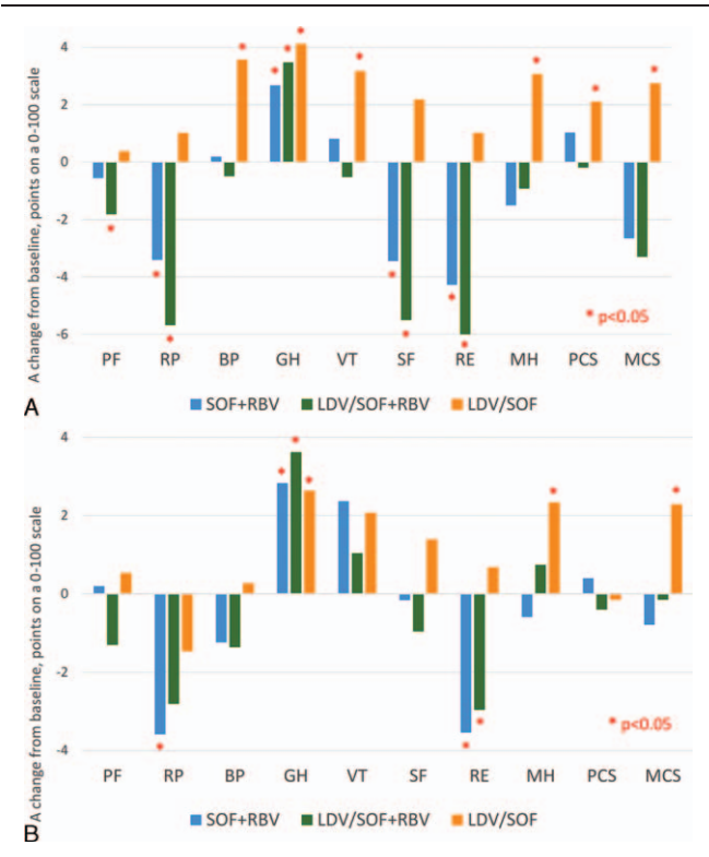
Figure 1. Treatment-emergent (A) and posttreatment week 12 (B) changes in HRQOL scores in Japanese patients treated with different anti-HCV regimens. A positive change indicates improvement of HRQOL. HCV=hepatitis C virus, HRQOL=health-related quality of life.