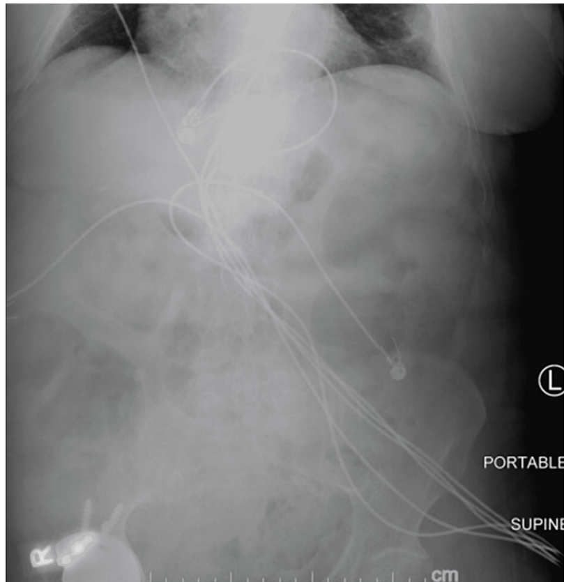
FIGURE 2: Abdominal X-ray showing no evidence of free intraperitoneal air, dilated colon, or obstruction.

While in the emergency department, the patient had a single loose stool with brown and bloody components. She was started on intravenous fluids and broad-spectrum antibiotics, namely ceftriaxone and metronidazole. Due to recent antibiotic exposure and evidence of colitis on the CT scan, the patient was tested for C. difficile . Both C. difficile DNA PCR and toxin were positive. The patient was then placed on contact precautions, parenteral antibiotics were discontinued, and she was started on oral vancomycin. On day 5 of hospitalization, an abdominal X-ray was performed to evaluate abdominal distension, which showed no evidence of free intraperitoneal air, dilated colon, or obstruction (Figure 2).