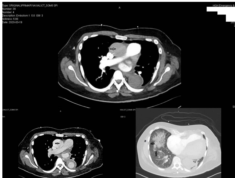
Figure 2. (A) CTPA showing an aortic dissection involving the root of the aorta extending to the arch of the aorta and right common carotid artery. (B) CTPA showing consolidative opacities in the right middle and lower lobes, (C) ECG-gated CT thorax showing the aortic dissection arising from the root of the aorta and involving the arch of the aorta with a dissection flap extending into the common carotid artery.