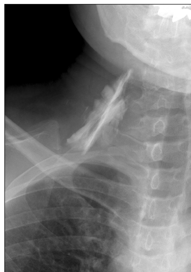
Fig. 1. Contrast imaging using 3.5 ml of contrast injected via the ultrasonography-guided interscalene brachial plexus block procedure in a volunteer. The image shows that the contrast has spread favourably close to the nerve root.

Changes in VAS scores at each of the observation points were compared with one-way repeated measures