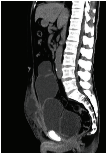
FIGURE 2: Sagittal unenhanced computed tomography images of the abdomen showing a distended neobladder and subcutaneous fluid accumulation in the lower abdomen. There is no evidence of ascites, intraperitoneal free gas, or incisional herniation.

filled with indigo carmine-stained saline, which confirmed the formation of a neovesicocutaneous fistula. In addition, contrast-enhanced CT of the abdomen revealed that the fistula was between the neobladder and skin, without apparent ischemia of the neobladder ileum (Figure 3). Flexible cystoscopy revealed a pinhole in the anterior wall of the ileal neobladder (Figure 4). However, there was no evidence of local UC recurrence. Because he was clinically stable, a surgical exploration was deferred, and he underwent a conservative treatment with urethral catheter drainage and broad-spectrum antibiotics. Subsequently, the fistulous tract closed 3 weeks later.