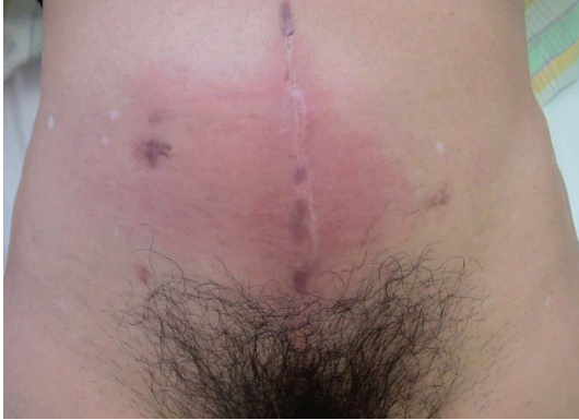
FIGURE 1: Images showing lower abdominal bulging with skin redness.