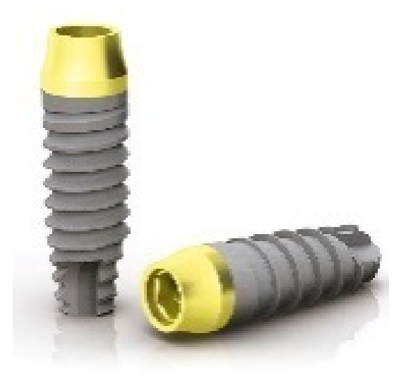
Figure 2. Prima implants (Sweden and Martina).

A healing abutment was placed according to a one-stage approach, and the flap was closed with a resorbable 4.0 suture. Periapical radiographs of the study implants were taken. Patients were instructed to have a soft and cool diet for 1 week and to rinse with 0.2% of chlorhexidine mouthwash for one minute twice a day for 14 days and were not allowed to wear any removable denture, which could load the study implants. Sutures were removed after 7 to 10 days, and oral hygiene instructions were delivered. Ibuprofen 400 mg was prescribed to be taken if needed.