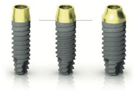
Figure 4. Reference point for marginal bone loss (MBL).