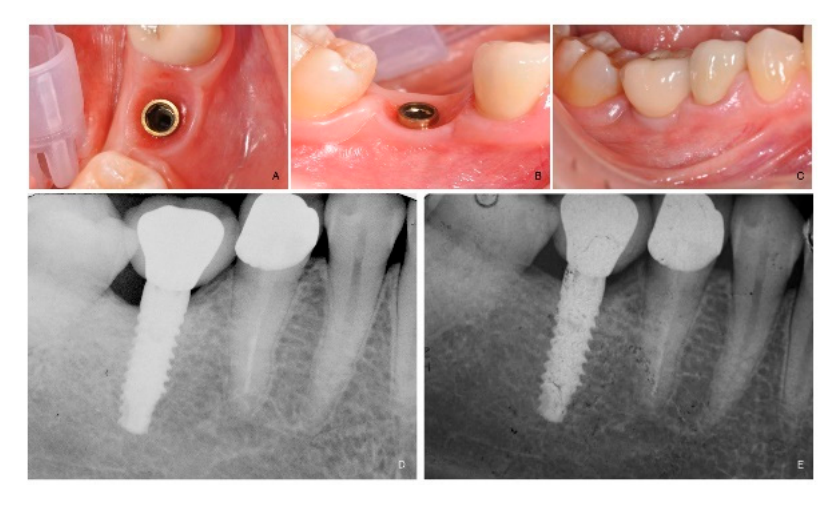
Figure 3. ( A ): Intraoral occlusal view of the implant immediately before prosthesis delivery at tooth number 46. ( B ): Intraoral lateral view of the implant immediately before prosthesis delivery. ( C ): Intraoral lateral view at one year after loading follow-up. ( D ): Periapical radiograph at prosthesis delivery. ( E ): Periapical radiograph at one year after loading follow-up.

Four months after implant placement (Figure 3A,B), a customized open-tray impression with screw-retained transfer impression copings was taken at implant level using a polyether material (ImpregumTM, 3M ESPE, Seefeld, Germany). The screw-retained prosthetic crowns were delivered within a month. The occlusal surface was kept in slight contact with the opposite dentition. Periapical radiographs and clinical pictures of the study implants were taken, oral hygiene instructions were delivered, and patients were enrolled in a follow-up program. (Figure 3C–E).