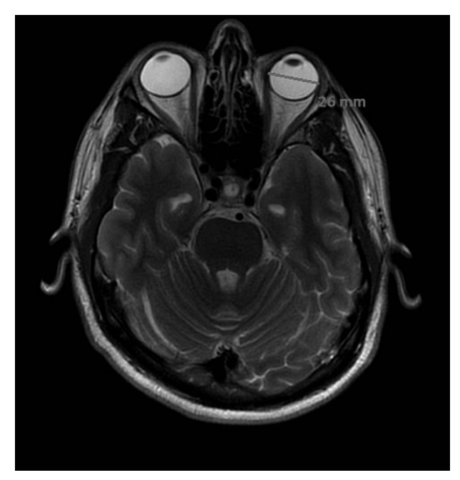
FIGURE 2. Eyeball transverse diameter was measured from the highest diameter of the eyeball on MRI using a fat-suppressed T2-weighted axial sequence.

tonsillar herniation, ventricular thinning, and filling defect in the venous sinuses, were recorded. Considering that no significant differences in the measurements between the right and left eyes of individuals were found in previous studies (Ballantyne et al., 2002), we only evaluated the left eye in this study. ONSD was measured at a point 3 mm behind the optic disc, The cursors were placed on the outer contour of the optic nerve, perpendicular to its longitudinal axis (Fig. 1), whereas ETD was measured using the longest diameter of the eyeball (Fig. 2). The past headache characteristics of the patients were reviewed, and their headache diagnoses were confirmed according to the ICHD-3 criteria. Neurological examination findings, such as papillary edema, visual field loss, motor deficit, and cranial nerve paralysis (especially abducens), were not detected in any of the included patients. This study was approved by the local ethics committee and conducted in accordance with the principles of the Declaration of Helsinki.