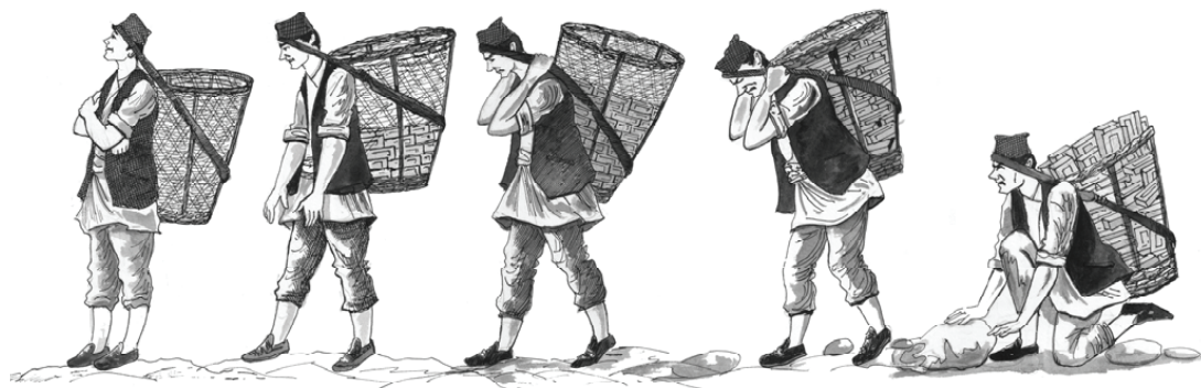
Figure 1 Picture-based response sets: water glasses, abacus, and dhoko-basket scales. Children in focus groups reviewed these three drawing series to determine appropriate pictorial response sets to maintain technical equivalence. The water glasses and abacus scales were generally understood. The dhoko -basket scale was not used because children consistently identified option '0' (empty basket) as 'sad' or 'lazy' because the boy had no bricks in his basket and would therefore earn no money compared with '4' (full basket), which was associated with happiness because of high earning potential with a large number of bricks.