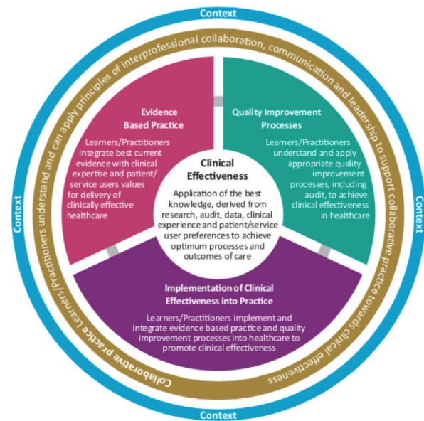
Figure 2 Diagrammatic representation of competency framework for clinical effectiveness education.

This competency framework shares similarities with existing frameworks but also has some important distinctions. Of note, for the EBP domain, we adopted (with permission) the international EBP consensus statement and core competencies derived from Albarquouni et al's 16 Delphi study. For the QI processes domain,