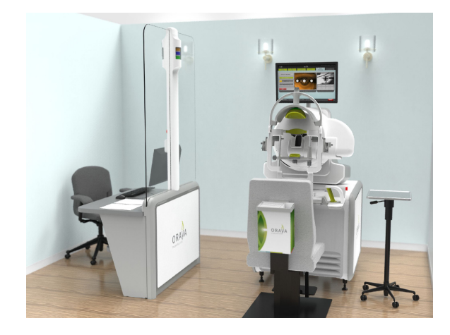
Figure 3 The room set-up of the IRay system. Notes: The operator controls (left) are separated from the radiotherapy machine (right) and patient by a lead-lined glass screen, allowing the operator to view the patient.

deliver treatment. A low energy X-ray tube produces three narrow collimated beams, which are designed to pass through the inferior sclera, avoiding the crystalline lens, and focus on the macula. Built-in computer software is used to robotically position the treatment based on the axial length of the eye that is entered into the machine by the clinician.