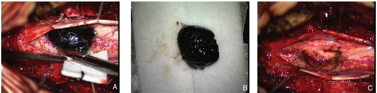
Fig. 2 A: An intraoperative photograph demonstrates an intradural extramedullary tumor. T11–L1 laminectomy is performed. After dural incision, a black-colored tumor with an intact capsule was noted on the surface of the spinal cord. The mass compresses the spinal cord. B, C: The tumor is completely extirpated.

prevent damage to the spinal cord. Microscopic examination under high-power magnification revealed no remarkable pial invasion and minimal subpial penetration and infiltration. The tumor did not involve nerve roots or the dura. There was no vascular invasion. Histological examination revealed that the tumor included a sheet-like proliferation of spindled to polygonal cells with enlarged nuclei and prominent nucleoli (Fig. 3). A moderate variation in nuclear size and shape was observed. Tumor cells had many dark pigment granules in the cytoplasm. Mitotic figures were only encountered occasionally. Immunohistochemical staining was positive for human melanoma black (HMB)-45 (Fig. 3C). Mind bomb homolog-1 (MIB-1) labeling showed an average of 6–7% in multiple fields (Fig. 3D). These histopathological data confirmed the diagnosis of primary spinal malignant melanoma. No postoperative neurological deficit was detected. A postoperative MRI confirmed the completeness of tumor removal. Because of the confirmation of complete removal of the tumor and considering the debatable efficacy of radiotherapy and chemotherapy controversial, 2,8–12) no adjuvant therapy was administered to the patient. Her neurological examination remained unchanged 5 years after the surgery, without recurrence or dissemination of the tumor on MRI. We aim to