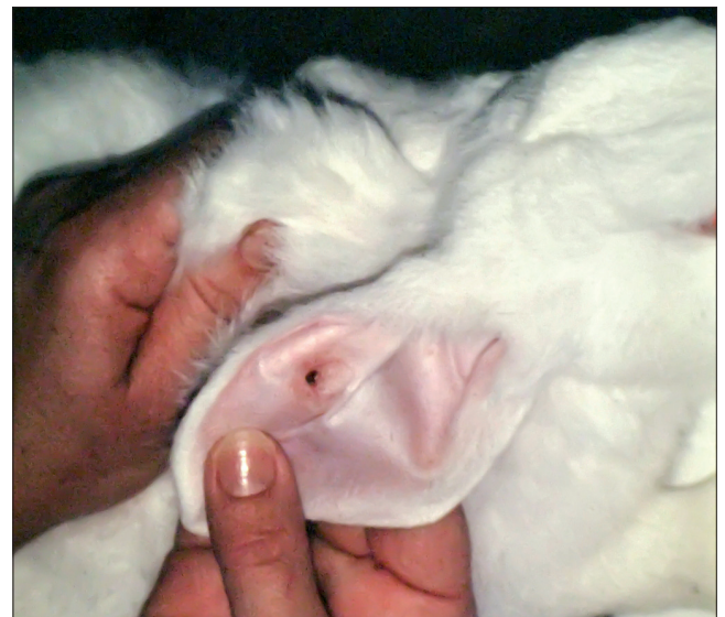
Figure 2. Handle with graft plasma.