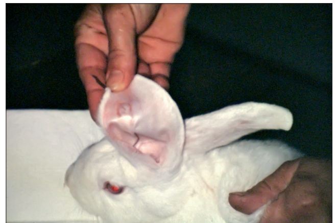
Figure 3. Handle with graft chemoprecipitate.