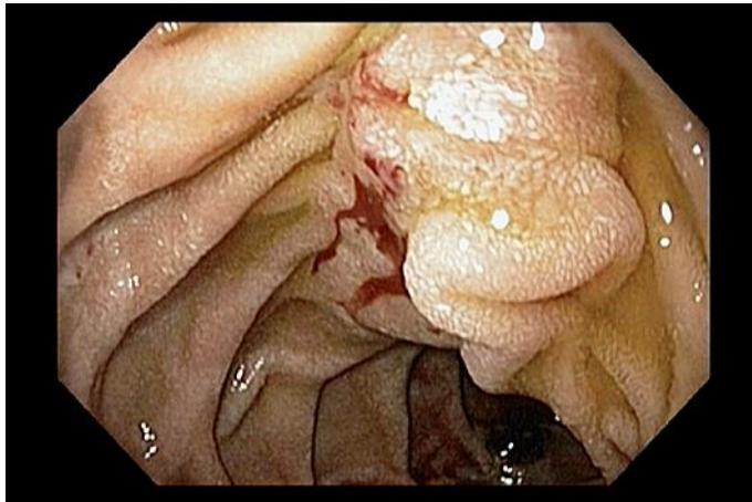
Fig. 1. Endoscopic picture of the second part of the duodenum showing a nodular mass with superficial erosion and active bleeding.