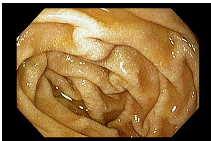
Fig. 3. Normal endoscopic picture of the second part of the duodenum.