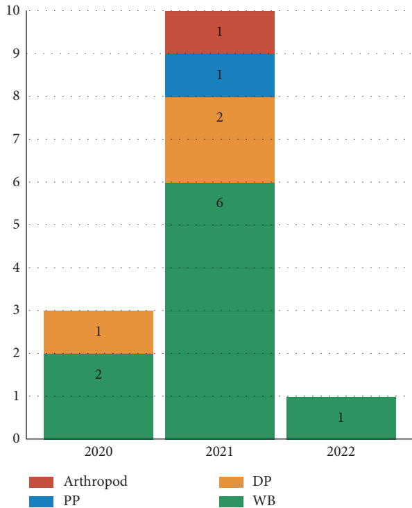
FIGURE 2: Distribution by published year(s) for each main epidemiological unit of focus in the 14 articles selected for the scoping review; PP: pig products; DP: domestic pigs; and WB: wild boar.

(September 2019–October 2019) and the remaining 13 cases occurring intermittently until October 2022. In wild boar, over 2,600 cases have been continuously detected in the country since October 2019. Nine articles investigated the transmission dynamics in domestic pigs or wild boar by either estimating transmission parameters or simulating disease dynamics.