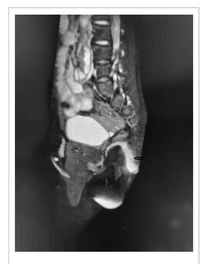
\label{eq:FIGURE 1 | Sagittal T2-weighted perineum MRI shows a 25- mm anal fistula (arrow).}