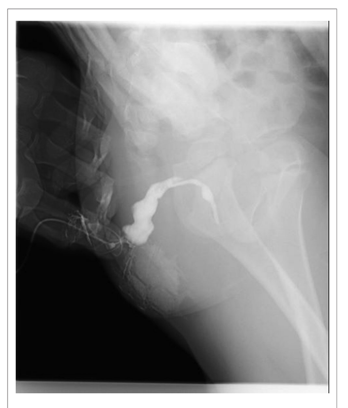
FIGURE 2 | Fistulography reveals a 25-mm-long tubular structure of about 1–3 mm in width without any connection with the rectum.