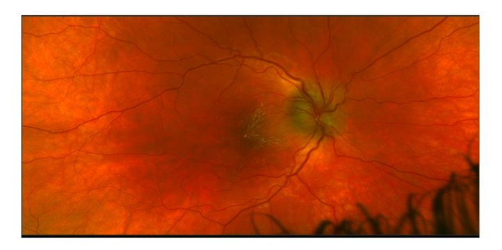
Fig. 2. Optos widefield photograph of patients's right eye posterior pole one week later. Continued optic disc edema with resolution of sub-macular fluid and subsequent appearance of macular star, suggesting neuroretinitis.

by the patient, the discussion is usually terminated.<sup>3</sup> When the patient asks how to manage their pet, ophthalmologists are usually at a loss.<sup>6</sup> Published guidelines<sup>1,2</sup> can lead patients to believe that they can attempt to remove fleas, or to remove the animal, and physicians caring for CSD patients have attested to giving this unfortunate advice.<sup>7</sup> Here we present an illustrative case of Bartonella -induced neuroretinitis acquired from the family pet, along with questions posed by the family, with the aim of discussing how to deal with such cases in clinical practice. We posed these questions with a few veterinarians and CDC experts and reviewed current guidelines for clinical practice when diagnosing CSD, to suggest an approach to dealing with scenarios in which these guidelines fall short.