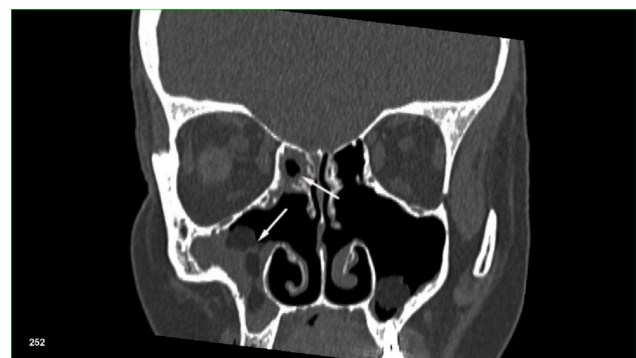
Figure 1 CT scan of the sinuses. Polyposis of the maxillary and ethmoid sinuses (white arrows) in a patient after previous sinus surgery, who underwent allogeneic hematopoietic stem cell transplantation because of primary myelofibrosis.

The majority of reports concerning sinusitis in hematopoietic stem cell transplant recipients have