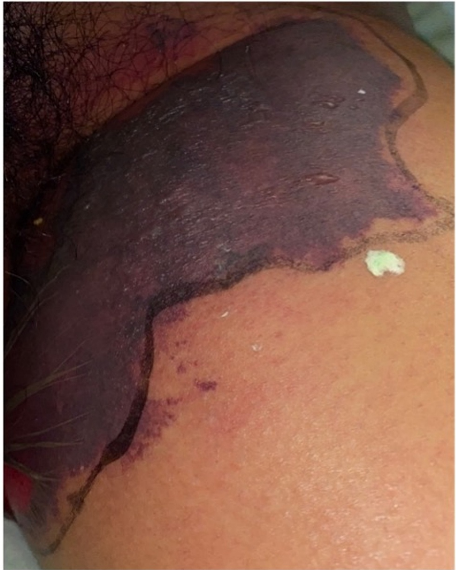
FIGURE 2: Purpura fulminans on the inner left thigh.

Blood cultures obtained on ICU day three revealed the presence of K. pneumoniae in two of two bottles, and the patient was transitioned to a seven-day course of intravenous ceftriaxone treatment. The source of infection was attributed to pneumonia. Serological examination showed negative results for hepatitis B and C, adenovirus, Bordetella , Bordetella pertussis , HIV, influenza, parainfluenza, respiratory syncytial virus (RSV), rhinovirus, Trypanosoma cruzi , legionella, and Streptococcus pneumoniae .