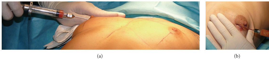
FIGURE 3: Purified fat and BMMNCs mixture reimplantation: (a) and (b) breast augmentation procedure (bicompartamental grafting).

is designed to deliver approximately 0.50 mL of tissue for each full brush of the operator's thumb. Minimally manipulated fat combined with BMMNCs was reimplanted strictly in two planes only: into the retroglandular and prefascial space and into the superficial subcutaneous plane of the upper pole of the breast (bicompartamental grafting) (Figure 3).