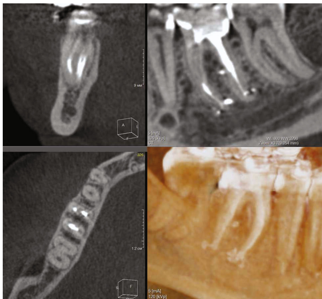
FIGURE 5: CBCT scan of tooth # 46 in 48 months after obturation. Full bone recovery is noticed.

resin creates extra the protection layer from leakage. The use of the composite resin as a full external layer increases the cost of the endodontic treatment.