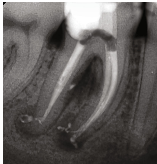
FIGURE 3: Apical radiograph of tooth # 46 after obturation.

The first appointment was finished placing a calcium hydroxide-based medication on the working length (Ultra-Cal XS paste; Ultradent Products, Inc., South Jordan, UT, USA). The floor of the pulp was covered with polytetrafluoroethylene (PTFE) and retained with the thin composite resin layer (Filtek Flow, 3M ESPE, Saint Paul, MN, USA) for the better sealing and retention. The outer part of the cavity was restored with intermediate restorative material (IRM) according to the double seal technique [9].