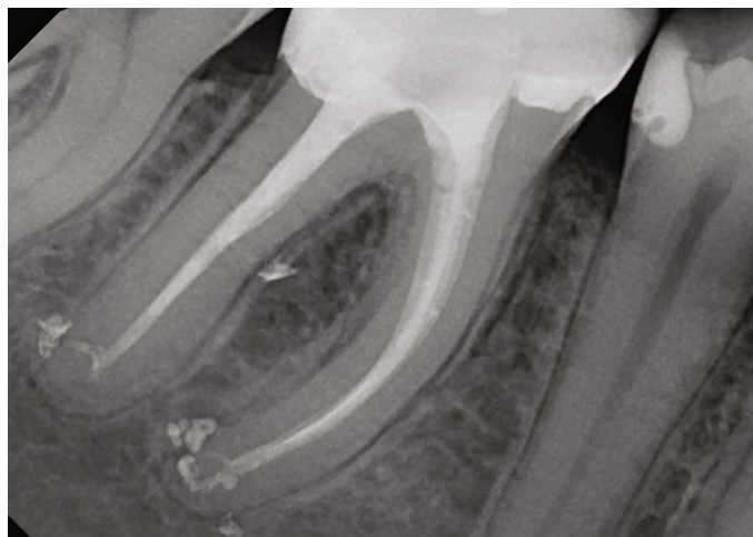
FIGURE 4: Two-year follow-up visit. Full healing was observed in the furcation and the periapical areas of tooth # 46.

disilicate full crown. The patient was recalled after 6, 12, 24, and 48 months (Figure 4). Total periapical and furcation healing was observed after 12 months and confirmed by the Cone Beam Computed Tomography (CBCT) scan 48 months after obturation (Figure 5).