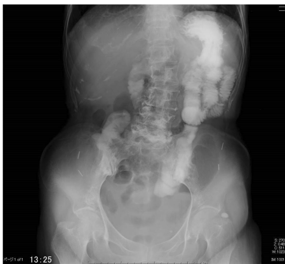
Fig. 3 An upper gastrointestinal contrast examination shows that the peristaltic movement of the upper gastrointestinal tract and the stomach had improved after the splanchnic nerve block

When the late sequelae include stenosis, perforation, and fistula formation in the intestinal tract, surgical treatment is recommended. However, the present case was not considered for surgical treatment because there was no evidence of occlusion or stenosis of the intestinal tract. Moreover, surgery should be avoided where possible because it promotes the adhesion of the intestinal