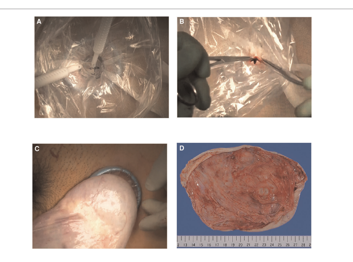
FIGURE 3 | Aspiration of the cyst fluid and cystectomy of the giant ovarian cyst. (A) Aspirating cyst fluid over the wrap. The cyst fluid of the serous cystadenoma flows from the puncture hole. (B) After cyst fluid aspiration, the mounting is pinched off with forceps to avoid intraperitoneal spillage of the cyst fluid. (C) The cyst is brought outside the body. (D) Resected giant ovarian cyst. The longitudinal diameter of the cyst is 205 mm. The pathological diagnosis was serous cystadenoma.