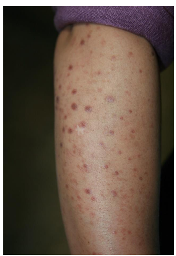
Figure 1: Pruritic and Purple Papules on the Right Forearm of a 43 Years Old Woman with a Diagnosis of Cutaneous Lichen Planus (LP) (Courtesy of Dr. Mirghorbani).

LP is a chronic, inflammatory autoimmune disorder affecting mucocutaneous membranes such as the skin, oral cavity, and vagina. Cutaneous LP, the most common type, is classically characterized by pruritic, purple, bilateral papules (Fig. 1) [4, 5]. The disorder is uncommon, presenting in roughly 1% of the population [5]. Middle-aged adults are most commonly affected by LP, with the disorder showing a slight female predominance [6].