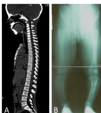
Figure 3. (A) 3DCT scan of the vertebral column (mid-sagittal) of a 17-year-old girl showed odontoid hypoplasia and square-shaped vertebral bodies with marked anterior end-plate dysplasia of the T9–11. (B) AP radiograph of the lower limbs (telemetric) in a 15-year-old girl showed leg shortening relative to the thigh, and metaphyseal widening of the inferior femora and the superior tibiae effectively causing the development of genu varum.

Laboratory investigations showed normal white and red blood cell and platelet counts, and normal serum calcium, phosphorus, and alkaline phosphatase levels. Further blood analyses showed normal