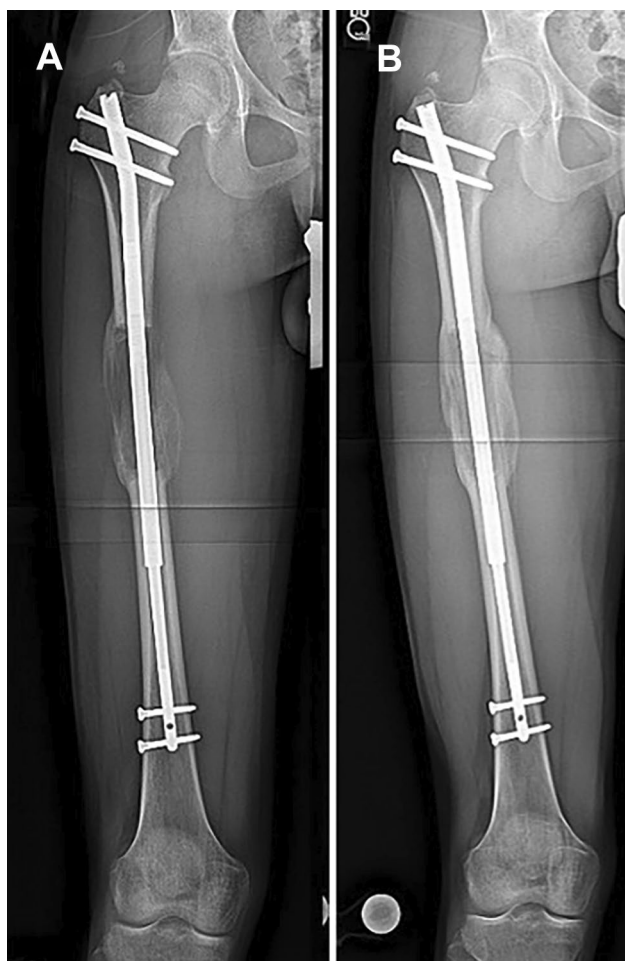
Fig. 1 Case example for STRYDE ® femoral lengthening, a antero-posterior (AP) radiographs at end of distraction, b AP radiographs at full consolidation

the difference was found to be statistically significant ( p value = 0.04).