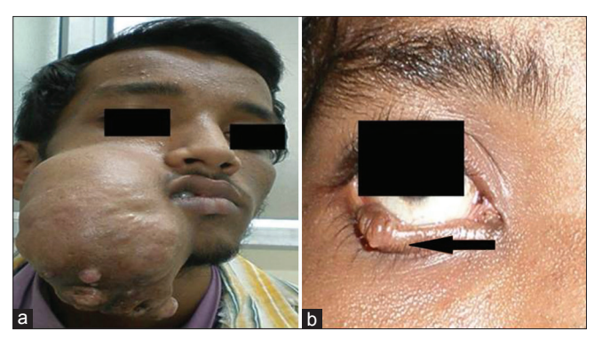
Figure 1: (a) Large nodular and focally ulcerated swelling on the right cheek (15 cm × 8 cm × 6 cm) (b) swelling on eyelid

The most common myxoid lesion in the cheek region to be ruled out is pleomorphic adenoma, which in addition to the chondromyxoid stroma, shows myoepithelial and ductal cells