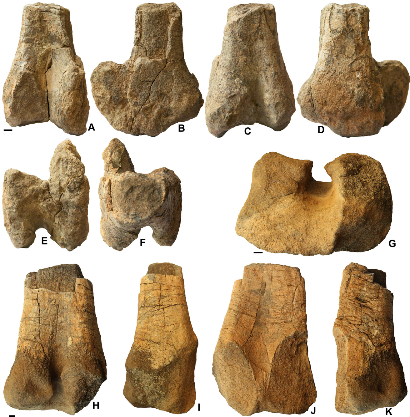
Fig 2. Hadrosauroid femora from the Al-Khod Conglomerate, Sultanate of Oman. Distal end of left femur ONHM 3744 in posterior (A), medial (B), anterior (C), lateral (D), distal (E) and proximal (F) view. Distal end of left femur ONHM 3745 in distal (G), posterior (H), medial (I), anterior (J) and lateral (K) view. Scale bars equal 1 cm.