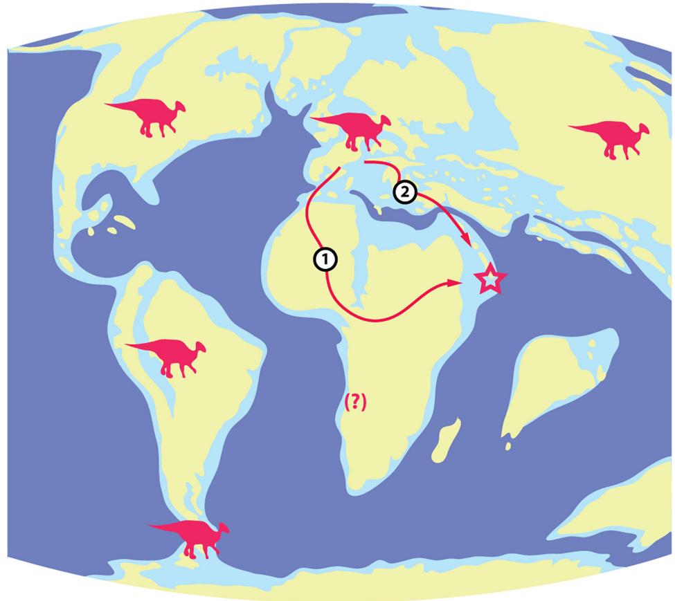
Fig 4. Suggested dispersal routes for hadrosauroids from Eurasia to the Late Cretaceous North-East Arabian archipelago of the Sultanate of Oman. Paleogeographic map simplified after [14].