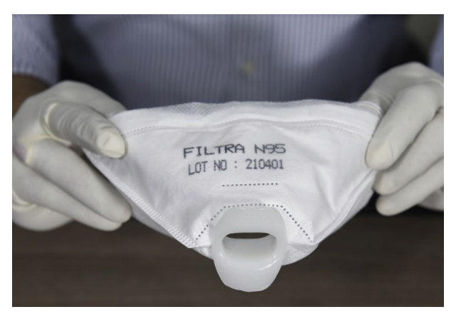
Figure 6. Modified mask to allow positioning of the mouth guard.