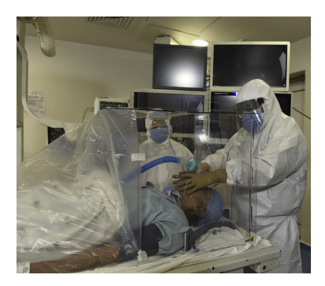
Figure 3. Endotracheal intubation done through the 2 holes at the head end.