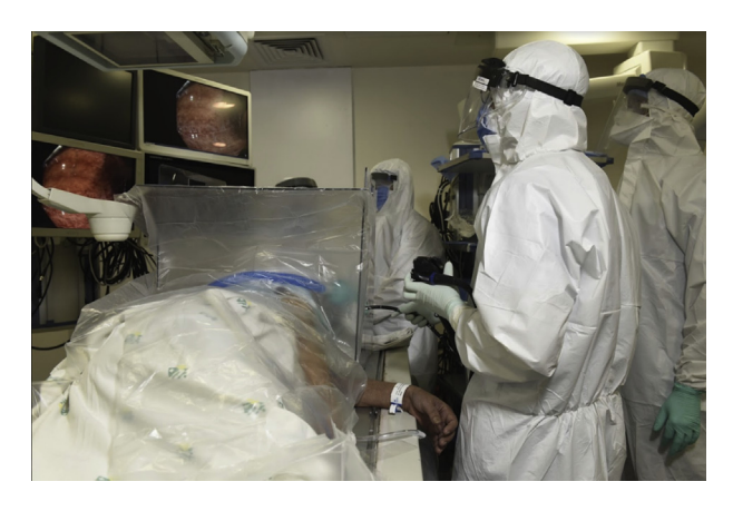
Figure 4. Endoscope piercing the hole in the left side wall.