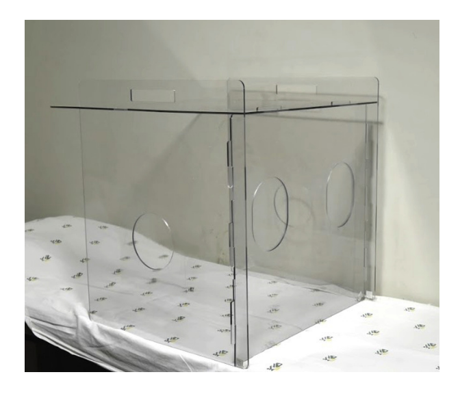
Figure 2. Aerosol chamber demonstrating the different holes.

hole on the left for endoscope introduction (Fig. 4). The height of the chamber allows manipulation of the laryngoscope to facilitate endoscopic intubation. During endoscopy, holes on the head end can also be used for stabilizing the patient (Fig. 5).