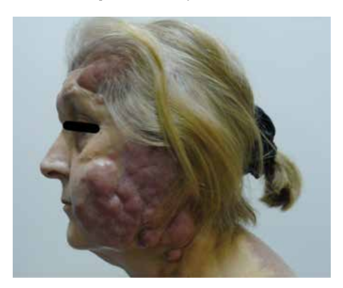
Figure 1. Patient with nodules and lumps of PCLBCL observed on the face and neck.

PCLBCL is a rare primary cutaneous lymphoma characterized by a diffuse proliferation of large B cells consisting of centroblasts and immunoblasts, occurring most commonly on the legs [1]. PCLBCL affects elderly population with a female predominance. This type of lymphomas tend to develop on the lower limbs, predominantly as large dermal nodules or tumors, which are either solitary or multifocal and rapidly enlarging [1]. PCLBCL can also rarely occur at other cutaneous sites [2]. The prognosis of PCLBCL is poor, with a 5-year survival of 41%-58%