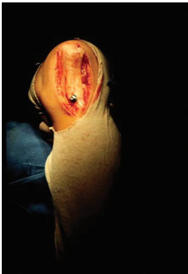
Fig. 3 Tibial anterior tuberosity medialization fixed with a spongy screw (according to the Elmslie-Trillat technique).