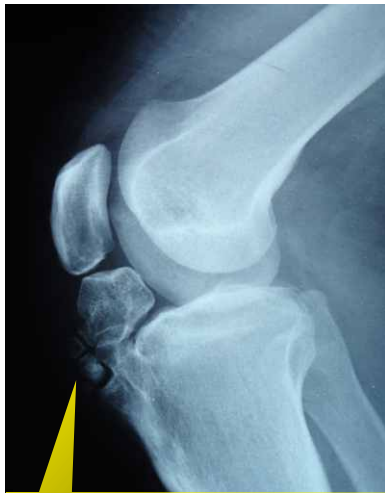
Figure 1: Lateral Knee radiograph showing a huge ossicle and two small ossicles that were separate from the tibial tubercle.