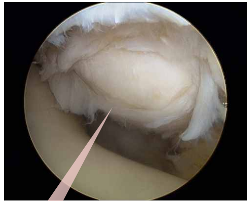
Figure 2 a: A bird's eye view of the whole ossicle through the superolateral portal