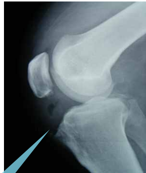
Figure 4: Postoperative lateral radiograph of the knee shows the flattened anterior-superior tibia without any residue of bone after excision of the ununited ossicle and contouring.