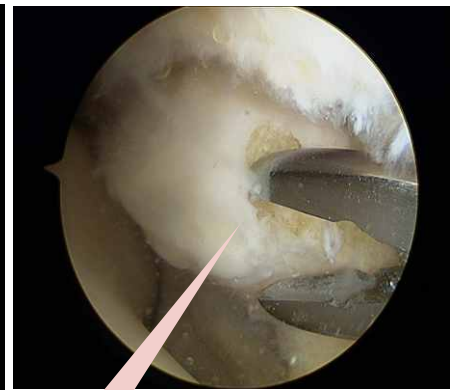
Figure 2 b: The huge ossicle was nibbled by a clamp and removed by a bur..

separate from the tibial tubercle. The largest diameter of the ossicle was 3 cm. Magnetic resonance imaging sections showed bow-shaped patellar tendon with tendonitis, but in good continuity.