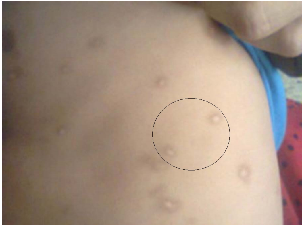
FIGURE 1: Maculopapular cutaneous mastocytosis nodules on trunk region.

A six-month-old, exclusively breastfed male, weighing 7.1 kg was admitted to the pediatric ward of Dr. Ruth KM Pfau, Civil Hospital Karachi (CHK) with a three-month history of nodules and a two-day history of respiratory distress. The patient was asymptomatic three months back, when his mother noted formation of multiple nodules on his trunk (Figure 1) and face. It was initially diagnosed as nodular scabies by a dermatologist because of its high frequency in our community and similar rash. Anti-scabies treatment was prescribed but as the number of nodules increased to involve the entire body including both extensor and flexor surfaces, he was hospitalized for evaluation. Presence of nodules was not associated with joint pains, vomiting, or diarrhea. There was no family history of similar disease. Other differential considered now for the skin lesions was one of the varieties of histiocytosis type IIa including juvenile xanthogranuloma, xanthoma disseminatum, and progressive nodular histiocytosis.