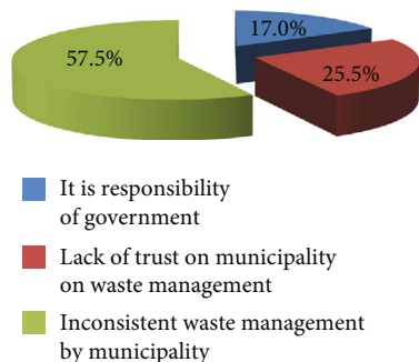
FIGURE 2: Participants' reason for not willing to join solid waste management services, 2022.