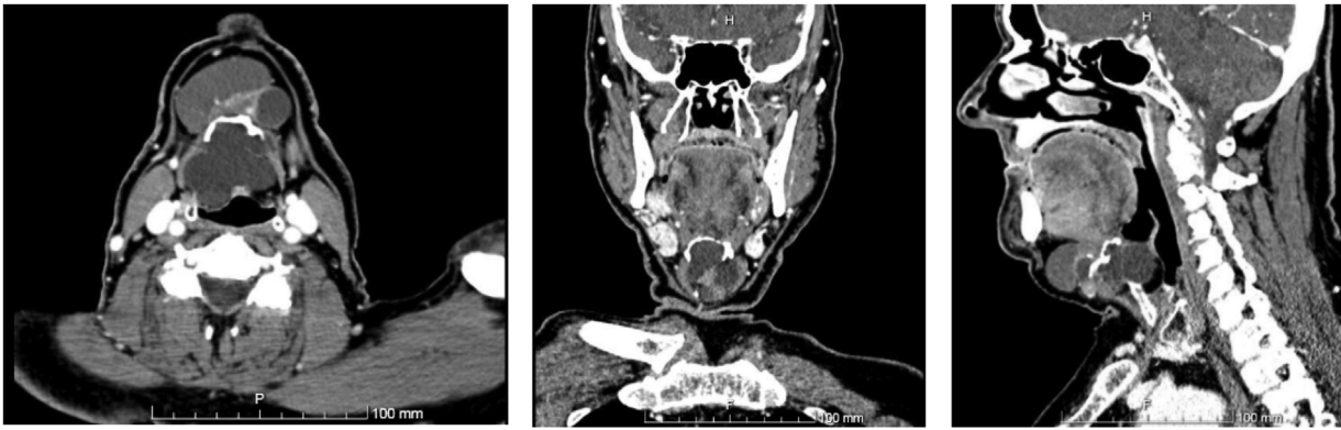
Fig. 1. CT scan.