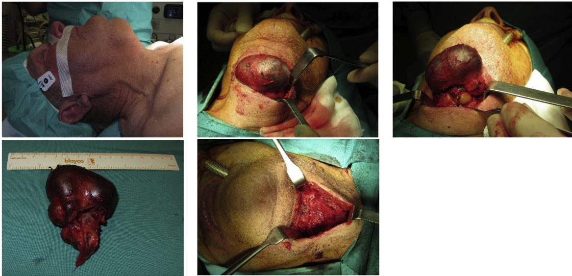
Fig. 2. Surgery: a. submental mass; b. and c. dissection of the cyst; d. surgical specimen; e. cyst's removal bed.