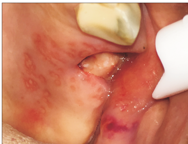
Fig. 5. Example of a maxillary posterior dry socket lesion surrounded by a viral outbreak. Although the outbreak may theoretically increase generalized inflammation around the dry socket, it is unknown if the outbreak increases pain or the duration of the dry socket or is only coincident with the lesion.

The cause of ischemia at a dry socket lesion site is unknown. Theoretically, the high forces of the extraction may crush and occlude blood vessels within the bone forming the intaglio surface of the socket (although there is no experimental evidence for or against compression-induced blood vessel occlusion existing in dry socket lesions). Some socket bone may be dense, with few blood vessels per unit of socket area, or a socket may be observed to only bleed from the apical aspect, making these sockets intrinsically incapable of significant bleeding. Smoking or oral contraceptive use may also reduce systemic blood circulation 17,18 . In addition, the pro-bleeding effect of plasminolysis may be counteracted chemically by pro-ischemia thrombin activity 34 at the dry socket wound site.