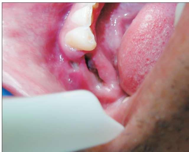
Fig. 3. A dry socket lesion with separate buccal and occlusal areas of exposed bone.

A healing dry socket is a previous dry socket that is now completely covered with vital epithelium such that this epi-