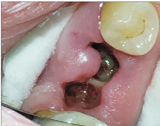
Fig. 1. A dry socket lesion where the socket perimeter is fully covered with healing epithelium, but a septum of exposed bone is visible inside the socket. The occlusal aspect of the septum bone is inferior to the projected plane of the occlusal aspect of the socket when the socket fully heals.

In this article, the basic treatment for dry sockets is to irrigate out food particles or bacterial material using chlorhexidine gluconate or saline and then fill the socket with a