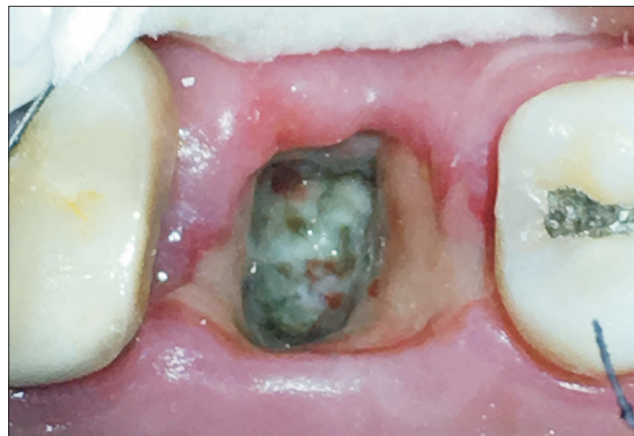
Fig. 4. Example of a previous dry socket lesion that is now fully covered with a layer of epithelium that does not wash away with irrigation.

Comprehensive reviews of the proposed causes of dry