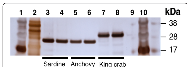
Figure 1 Purified king crab trypsin differs in size from purified sardine trypsin. 250 ng of purified king crab and sardine trypsin were run on a SDS-PAGE gel and stained with silver staining for detection. The result shows that purified king crab trypsin (lane 7 and 8) is a slightly bigger molecule residing in the 28 – 30 kDa area compared to the purified sardine trypsin (lane 3 and 4) at 24 – 25 kDa. Additional purified fish trypsins tested (anchovy (lane 5 and 6), yellow tail, jacoever, spotted mackerel (not shown)) displayed similar size as purified sardine trypsin. Lane 1, 2 and 10 contain protein standards, respectively 10 µl SeeBlue®, 10 µl Mark 12™, 16 µl SeeBlue®. Lane 9 is empty.

The effect of temperature on the enzymatic activity of four different trypsins (bovine, salmon, sardine, and king crab) was examined using the substrate DL-BAPNA at room temperature and 37°C. As depicted in Figure 2, the total enzymatic activity of all trypsins decreased with lowered protein concentration. Comparing the enzyme activities at room temperature showed that salmon and