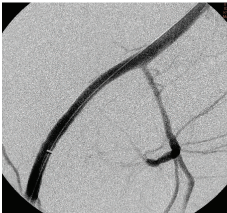
FIGURE 3: Right common iliac angiogram poststenting demonstrates successful treatment of arterio-jejunal fistula.

angiogram of the abdomen and pelvis showed a patent right iliac stent with no extravasation on contrast medium. On day 13, the patient was successfully extubated, but remained hemodialysis dependent until day 19 at which point creatinine stabilized at 3.2 mg/dL. On day 20, she was transferred to the hospital where she originally underwent deceased donor pancreas transplantation in 2008. No further intervention was undertaken and the patient was discharged home one week later. Her hemoglobin remained stable at 11.1 g/dL and 11.8 g/dL and serum Cr 3.0 mg/dL and 3.1 mg/dL at the 6, and 12-month followup points, respectively.