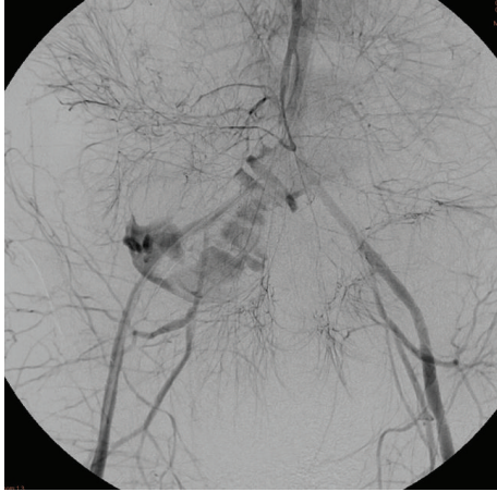
FIGURE 2: Superior mesenteric arteriogram (with injector device) demonstrates arteriojejunal fistula via the right external iliac artery.